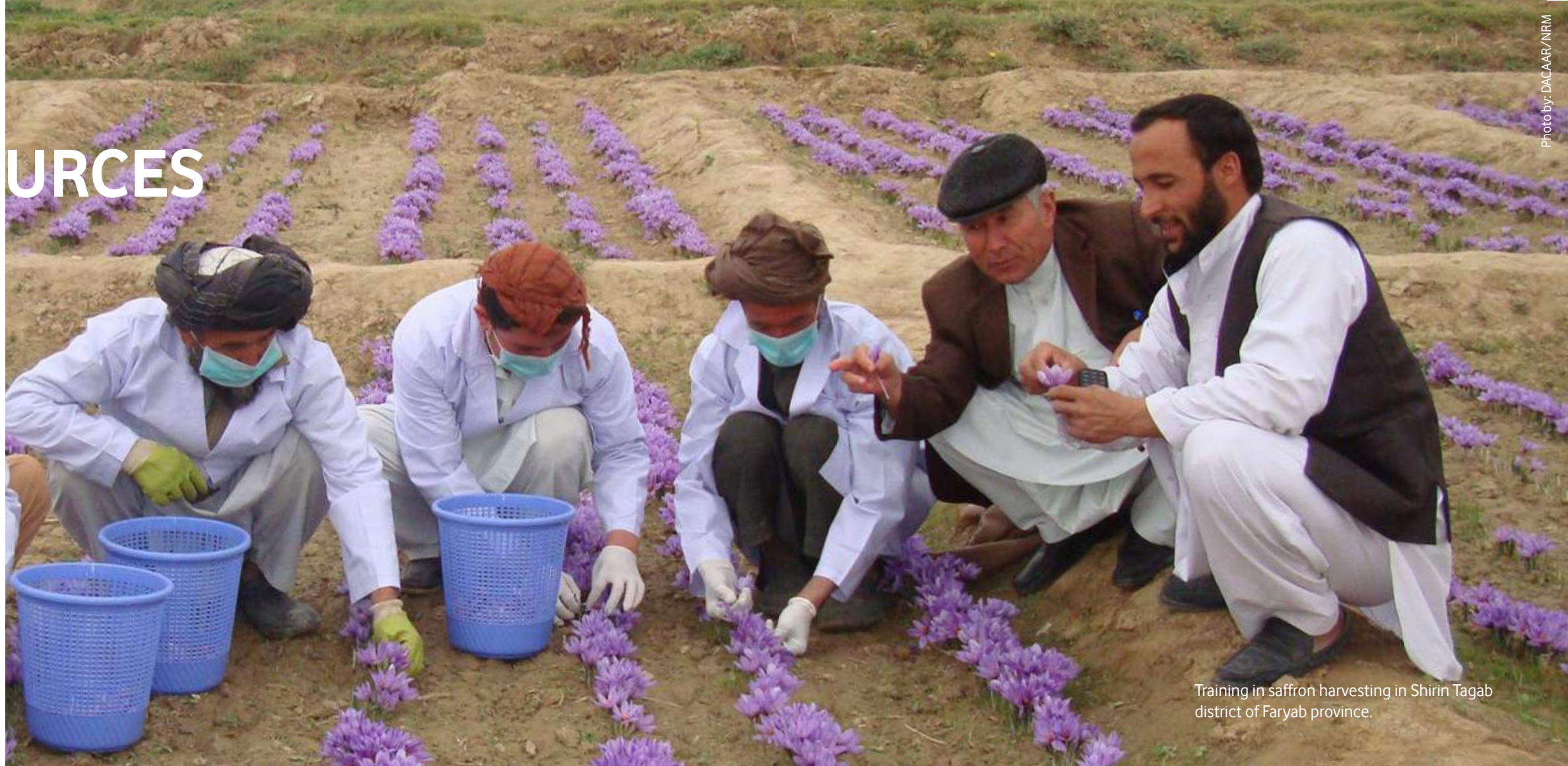
Training in saffron harvesting in Shirin Tagab district of Faryab province.

Drought was a major challenge for the Natural Resources Management programme in many provinces in 2018.