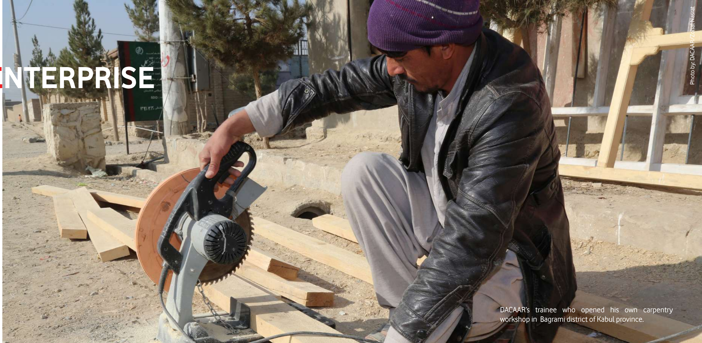
DACAAR's trainee who opened his own carpentry workshop in Bagrami district of Kabul province.

In 2018, one of the major achievements in this programme was the completion of the data base that enables us to follow up on our training participants to see how they benefitted from the vocational training.