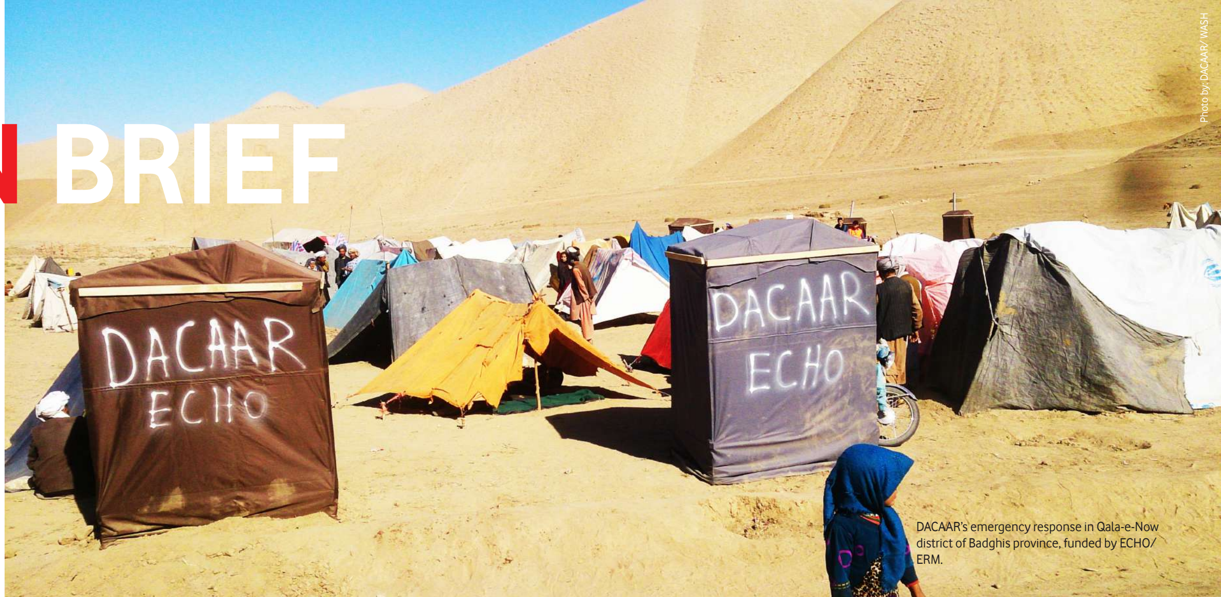
DACAAR's emergency response in Qala-e-Now district of Badghis province, funded by ECHO/ERM.